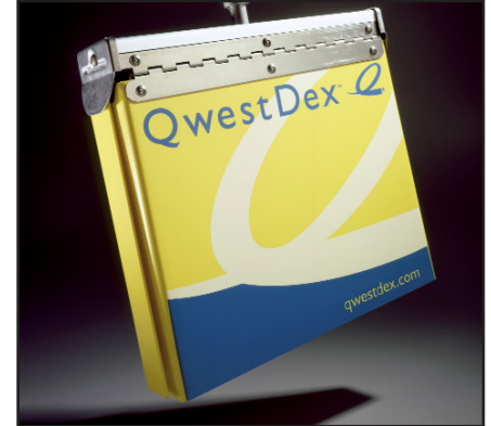
Telephone directory binders of KYDEX® sheet, an aluminum spine, and spring-loaded stainless steel hinges close in clamshell-fashion to minimize effects of weather, vandalism and wear.

A proprietary swing-up holder shields the directories from destruction by encasing them in binders made of thermoformed KYDEX® thermoplastic sheet from KYDEX Company, LLC. Denver-based Qwest – and telecommunications giant US West, which it acquired in 2000 – have purchased the swing-up directory holders for nearly 20 years from its manufacturer, Benner-Nawman, Inc., headquartered in Wickenburg, AZ.