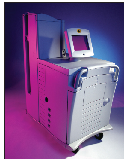
The Heart Laser housing measures 711 x 1220 x 1575mm (28" X 48" X 62"). Pressure-formed of KYDEX® Vinyloy™ 103 thermoplastic alloy, it won the Annual Thermoforming Institute Award of Excellence.

Early production results confirmed their decision. "We got – and still get – better forming than with other materials we might have used," Wahl points out. "The Vinyloy moves through the forming process faster and gives us greater uniformity on even the deepest of draws".